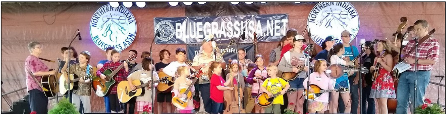
Grant-Funded Bluegrass Kids' Academy, Spring 2019

The $3,000 grant check should have arrived by the time you get this newsletter. As a part of the grant requirement, letters were written to Senators Mike Braun and Todd Young (hand written) and Representative Jim Banks, all of Indiana. Each letter also included 3 pictures of our kid's activities at the festival. Again our thanks to the Indiana Arts Council for the grant.