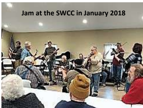
Jam at the SWCC in January 2018

As the winter stretches on, and I start getting stir crazy, I find it is good therapy to attend as many jam sessions as possible. Apparently, I am not the only one who feels that way, because the NIBGA monthly jam sessions have been