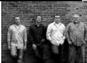
New County Grass SAT