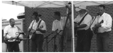
Home Grown Grass THR