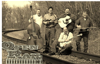
Open Rail FRI