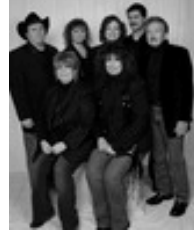
Berachah Valley FRI