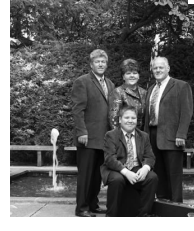
Blanton Family FRI