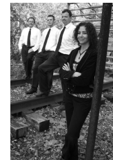
Tish & Co. SAT